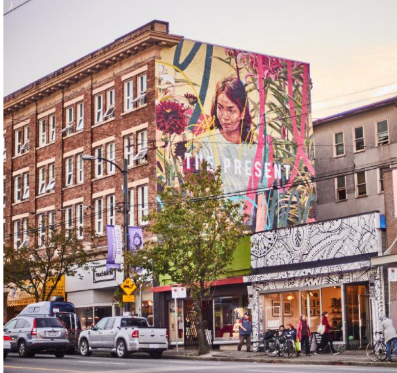
A Walker's Paradise

Live in the heart of an artistic, authentic and friendly neighbourhood.